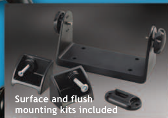
Surface and flush mounting kits included