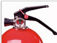
GLORIA PD 2 - valve look