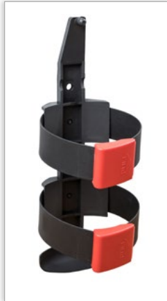
GLORIA's car bracket and patented security strap